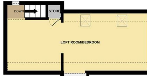
2ND FLOOR 206 sq.ft. (19.2 sq.m.) approx.