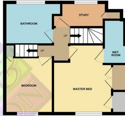
2ND FLOOR 206 sq.ft. (19.2 sq.m.) approx.