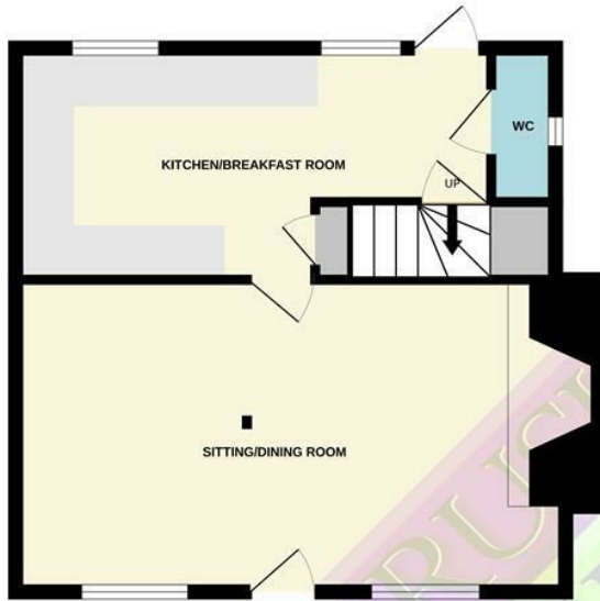
GROUND FLOOR 429 sq.ft. (39.9 sq.m.) approx.